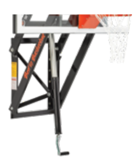
Wall Anchor Frame