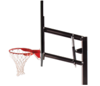
ELITE PLUS BOARD ARMS