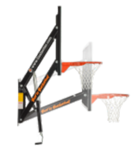
External Height Adjustment Mechanism from 6'-10'