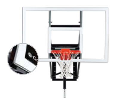
1 ½" Square Structural Steel Backboard Frame